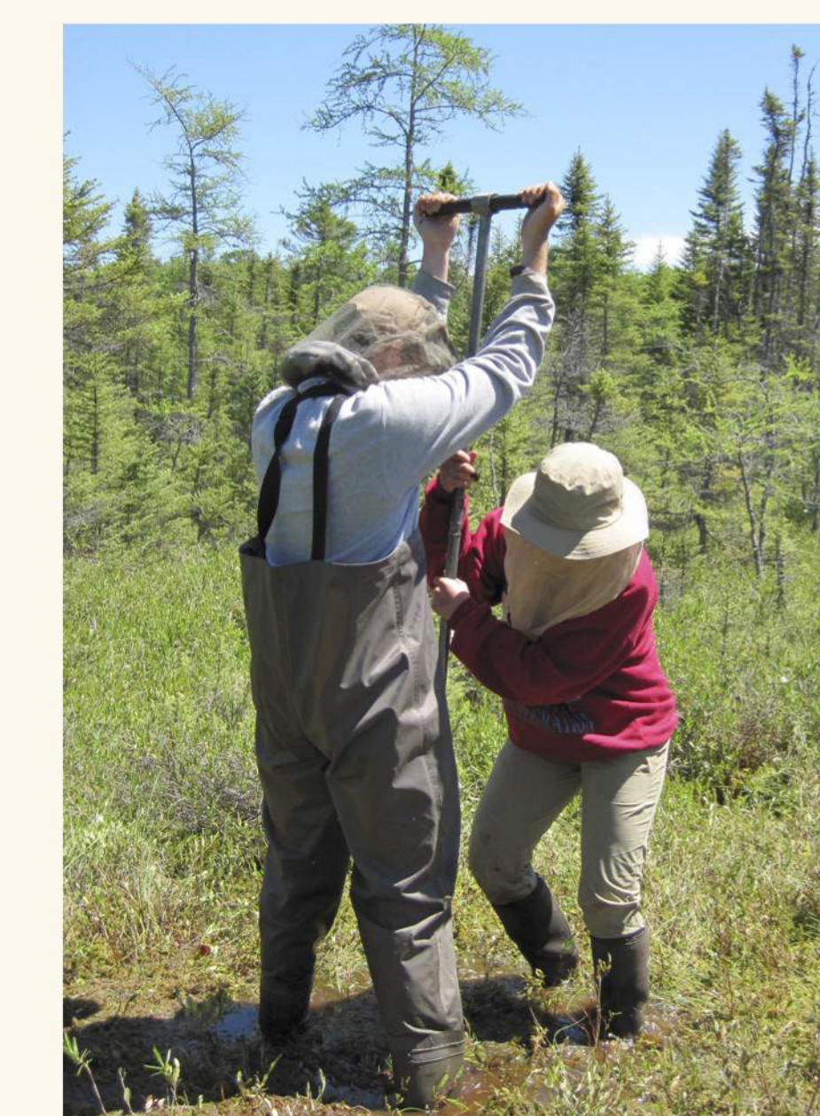
Using the Russian core in Brander Bog (left).