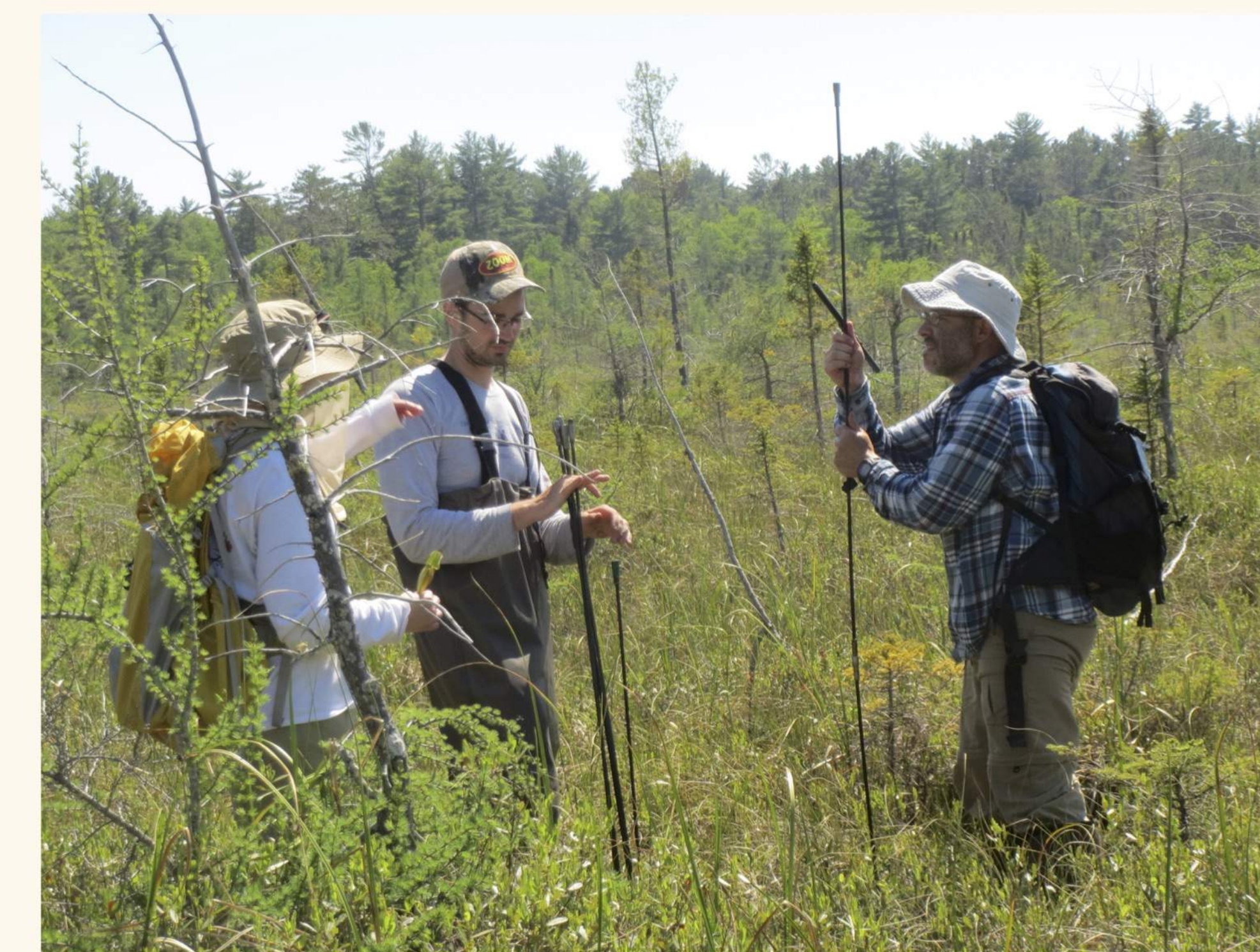
Measuring depth of Stockton Bog.

During the remainder of summer 2018, I subsampled the Brander Bog peat core for testate amoebae, charcoal, loss-on-ignition, and pollen analyses. The core was sliced into 1-cm increments, and 1-2 cm 3 of peat was collected for each of these analyses.