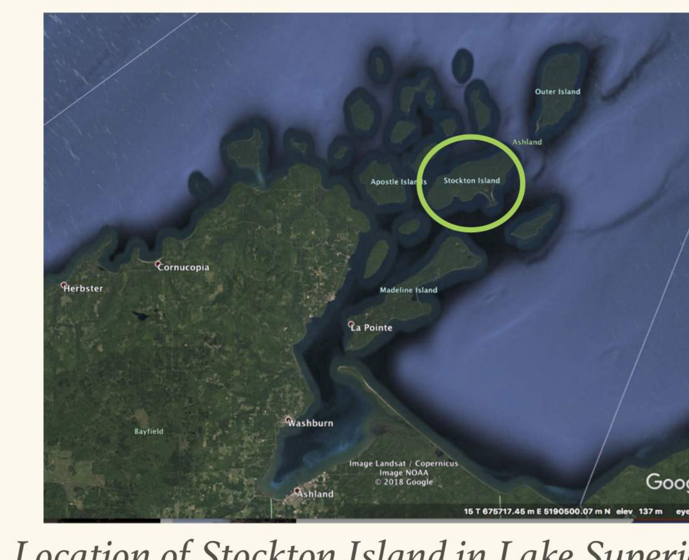
Location of Stockton Island in Lake Superior.