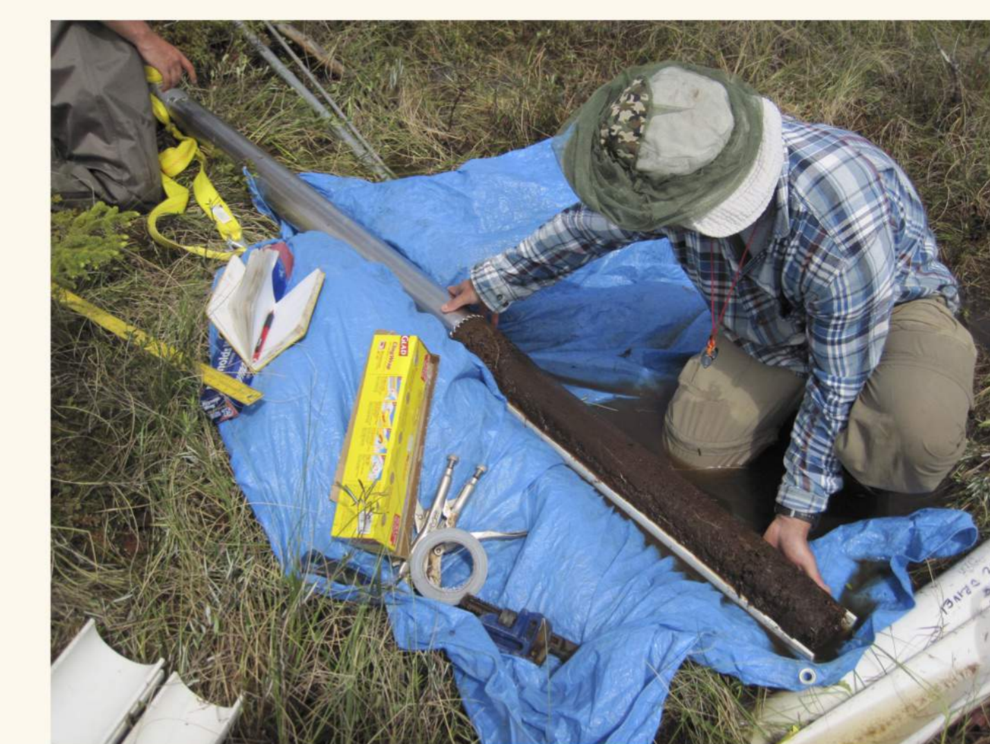
Larger core taken from Stockton Bog.

Samples will be collected from along the core for radiocarbon dating, and an age-depth model will be developed from these results.