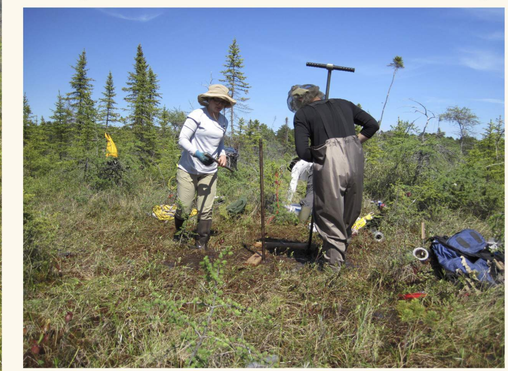
Using the Russian core in Stockton Bog.