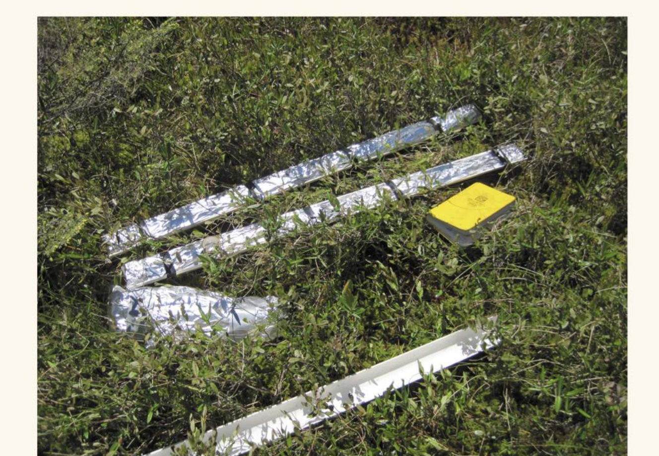
Russian cores taken from Brander Bog.